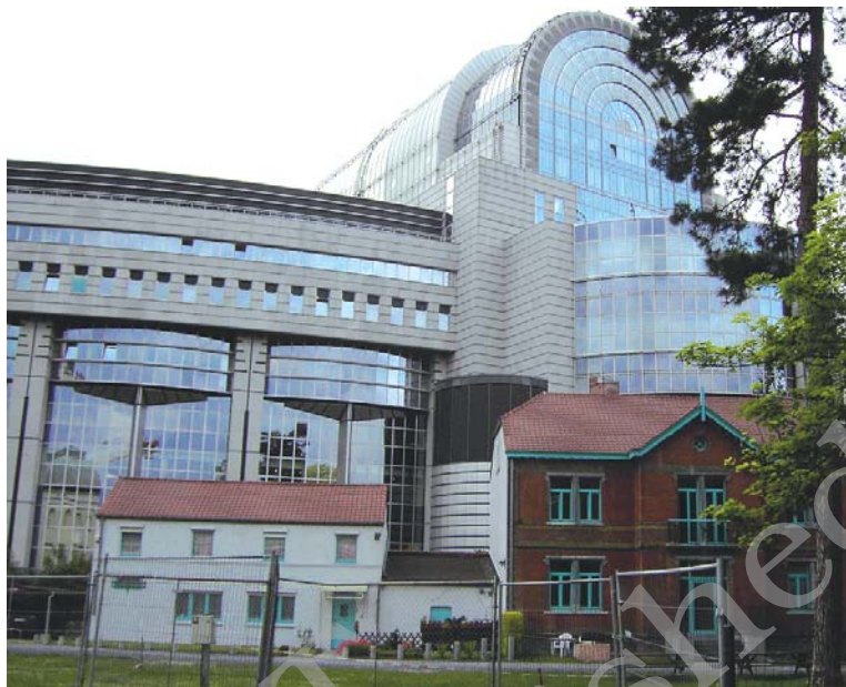
European Union Parliament in Belgium

You might find the Belgian model very complicated. It indeed is very complicated, even for people living in Belgium. But these arrangements have worked well so far. They helped to avoid civic strife between the two major communities and a possible division of the country on linguistic lines. When many countries of Europe came together to form the European